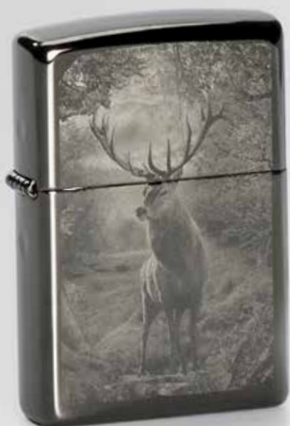
49059 Black Ice® Photo Image