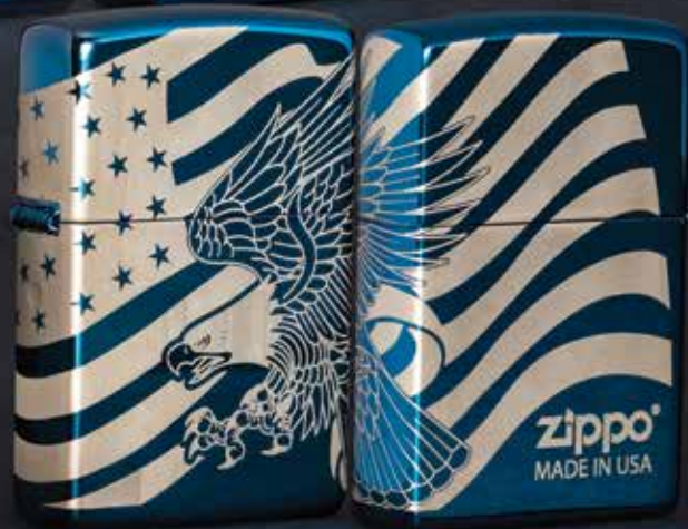
49046 High Polish Blue Laser 360°