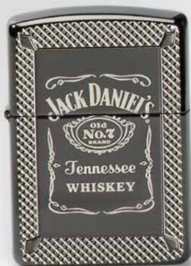
49040 Armor® High Polish Black Ice® Deep Carve/Laser Engrave

JACK DANIEL'S and OLD NO. 7 are registered trademarks used under license to Zippo Manufacturing Company. © 2019, Jack Daniel's — All Rights Reserved. Your friends at Jack Daniel's remind you to drink responsibly. For sale to adults of legal drinking age.