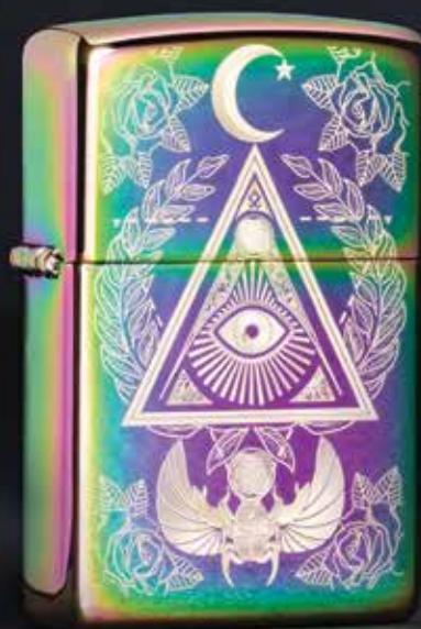
49061 Multi Color Laser Fancy Fill