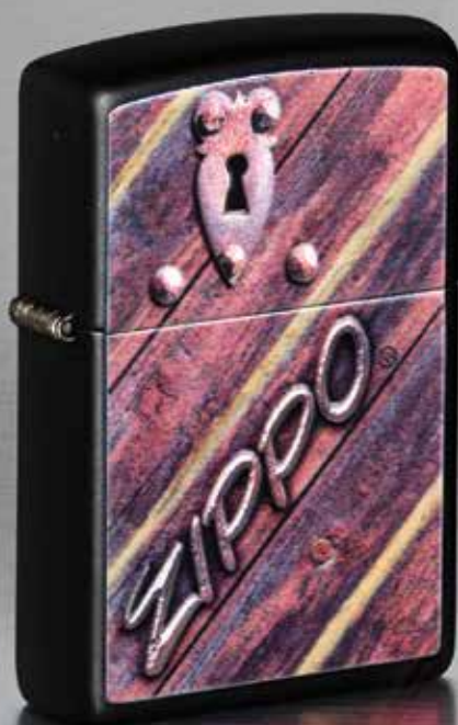
29986 Black Matte Texture Print

© 2019 Playboy Enterprises International, Inc. Playboy and the Rabbit Head Design are trademarks of Playboy Enterprises International, Inc. and used under license by Zippo Manufacturing Company.