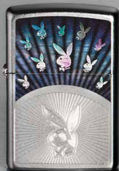
49002 Satin Chrome Color Image/Auto Engrave