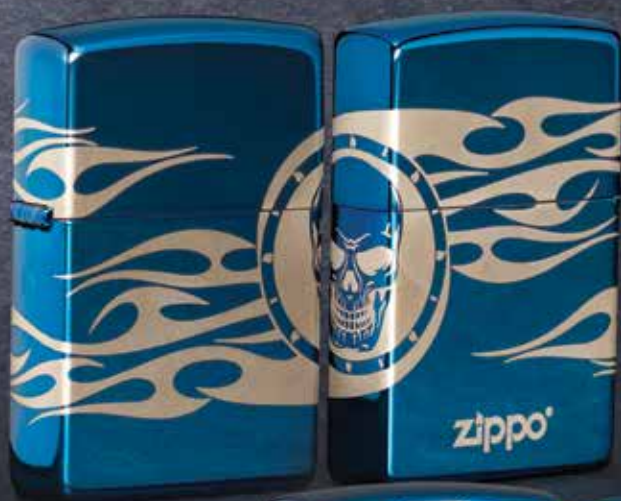
49048 High Polish Blue Laser 360°