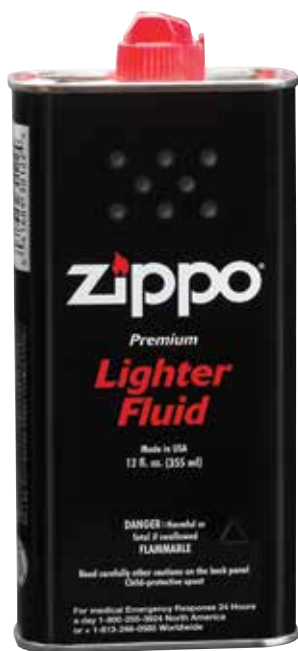
3165EX Lighter Fuel 12 oz. Shipping carton of 24.