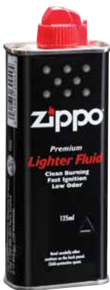
3141EX Lighter Fuel 4 oz. Shipping carton of 96.