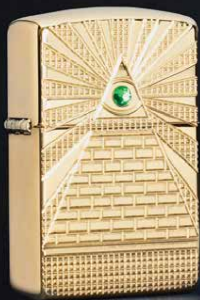
49060 Armor® High Polish Brass Deep Carve/ Emblem Attached

The all-seeing Eye of Providence adorns two new Choice designs. The first casts the divine gaze from a green Swarovski® crystal set into a deep carved pyramid on a Brass High Polish Armor lighter, and also features a gold flashed insert. The Multi Color finish lighter is adorned with additional ancient symbols surrounding the Eye – each detail within this design created by Zippo's intricate Laser Fancy Fill process.